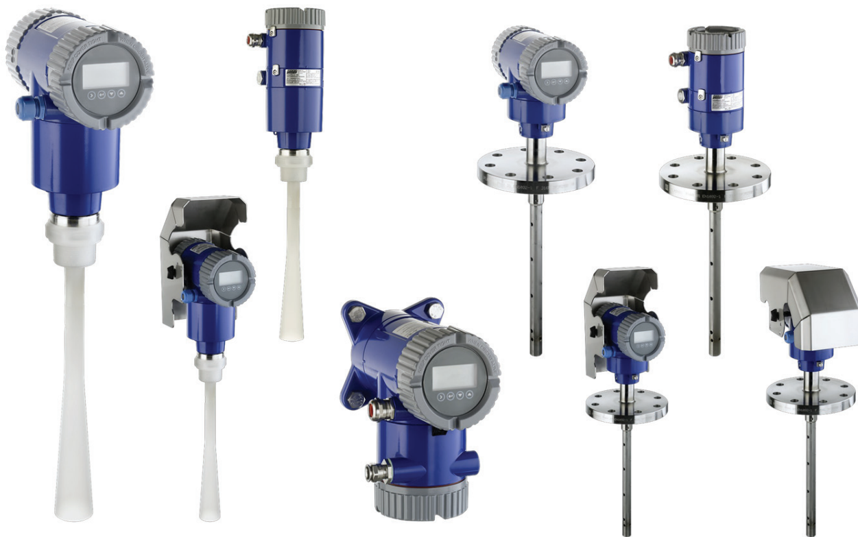
LevelWave Series including compact, remote and weather proof protection options

If you have any queries about which codes to use please email systems.support@schneider-electric.com .